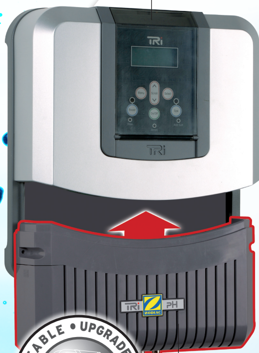
Salt Water Chlorinator TRi®